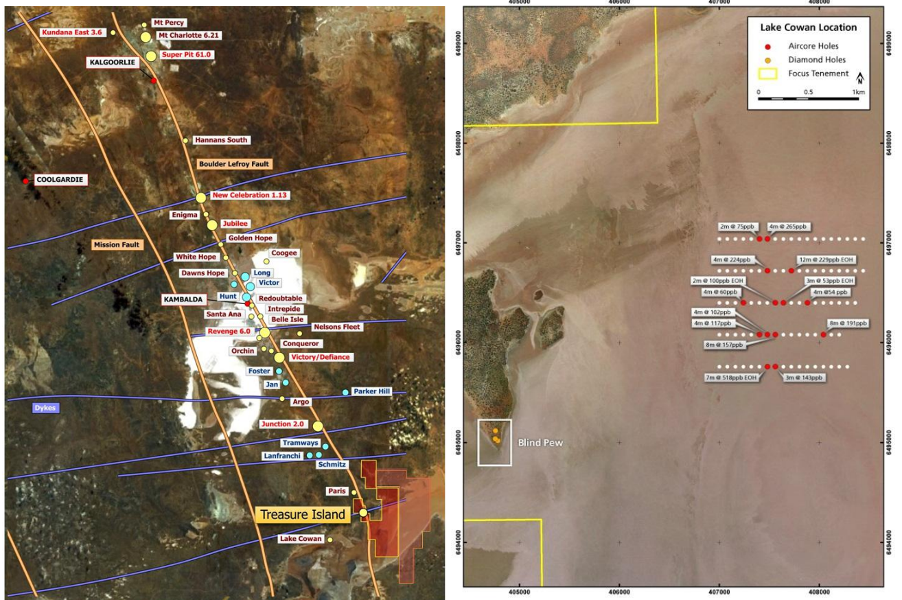
Fig. 1: Treasure Island Project Location (LHS); New emerging mineralised system (RHS)